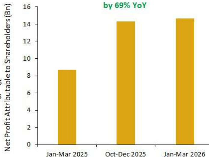
Cumulative Net Profit Attributable to Shareholders increased by 2% QoQ, increased by 69% YoY